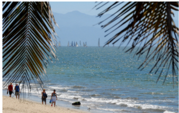
Sailboat race from Bucerias Village